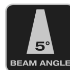
Beam angle 5° Exceptionally focused beam angle