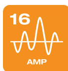
Connects to any 16A (3 phase) charging unit or station with a type 2 connection.

Charge at home and on the moveType 2 to Type27 PIN | 3PHASE