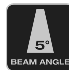
Beam angle 5°

Improved far and near field illumination