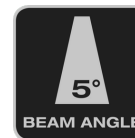
Beam angle 5° Exceptionally focused beam angle