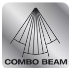
Combo Beam Combined beam of light