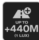
Lighting distance up to 440 meters Improved far and near field illumination