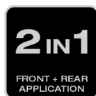
2 in 1: Front and rear application

Matched to individual requirements and needs for versatile applications