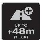
Up to 48 m long beam

For a large-area and wide light distribution