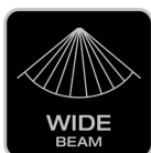
Wide Beam Pattern

For a large-area and wide light distribution