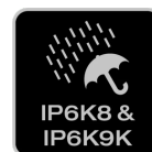
IP & IK protection classes

Matched to individual requirements and needs for versatile applications