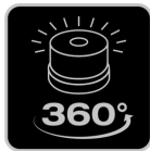
360° rotating warning light

Rechargeable Li-Ion battery via USB-C charging cable